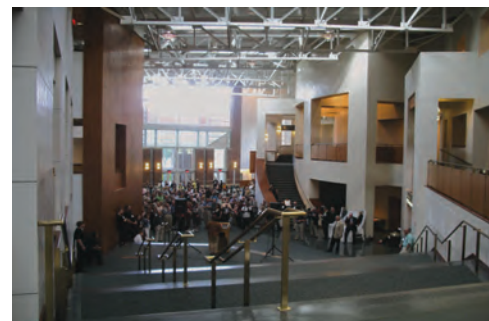
IFTR Opening Reception at the Clarice Smith Performing Arts Center June 27, 2005