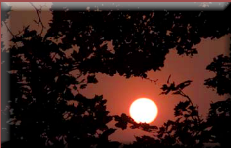
Red Sun

Another Language Performing Arts Company is celebrating twenty-five years of creative expression!