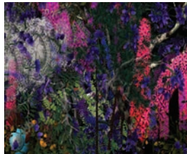
Forest On Black