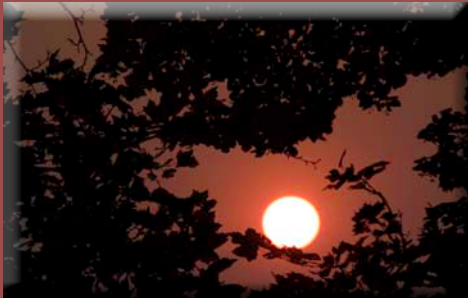
Red Sun

Another Language Performing Arts Company is celebrating twenty-five years of creative expression!