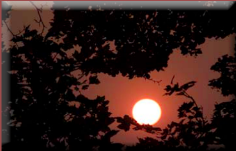
Red Sun

Another Language Performing Arts Company is celebrating twenty-five years of creative expression!