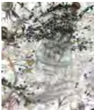
Roses in Vase