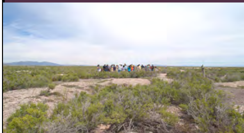
Topaz Site

This year the Utah Academy of Sciences, Arts and Letters annual excursion was to the Topaz Internment Camp site in Delta, Utah. After Topaz the group traveled to the Great Basin National Park in Nevada and toured the Lehman Caves.