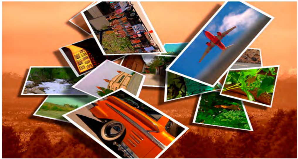
Salt Lake City in 90 Seconds created for TorinOver International Sister Cities Project.

Another Language Performing Arts Company is participating in an International Art Project that is coming to Salt Lake and will be exhibited in various locations throughout the city.