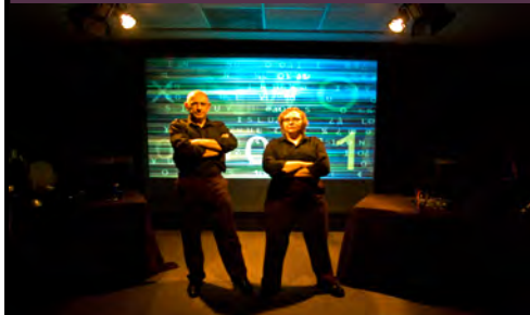
Duel•Ality 1.0 CHPC Spring newsletter article available at www.anotherlanguage.org/education

This year the Utah Academy of Sciences, Arts and Letters annual excursion was to the Topaz Internment Camp site in Delta, Utah. After Topaz the group traveled to the Great Basin National Park in Nevada and toured the Lehman Caves.