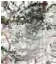
Roses in Vase