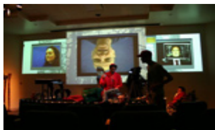
InterPlay: Nel Tempo di Sogno Dress Rehearsal

AUGUST 16, 2007 PRESENTATION NEUMONT UNIVERSITY, SALT LAKE CITY SPONSORED BY JENNI LOU OAKES