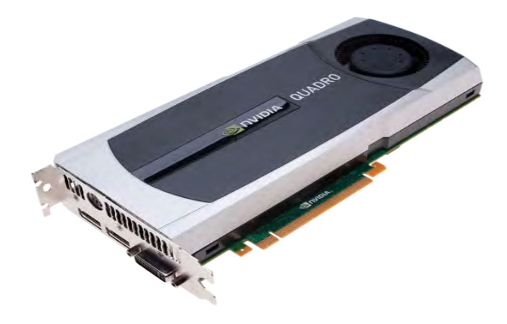
NVIDIA Quadro 5000 3D Graphic Card

(GPU) with 352 Compute Unified Device Architecture (CUDA) Cores and a 2.5 GB Frame Buffer. The device can process up to an amazing 950 million triangles per second. The projector is an Acer H5360 1280 x 720, 2500 Lumen DLP system. In preliminary tests with one of the popular 3D video games, it felt that players could just step into the game and vanish into the digital nether world. The company is excited about updating and developing visual content for Duel•Ality 2.0 .