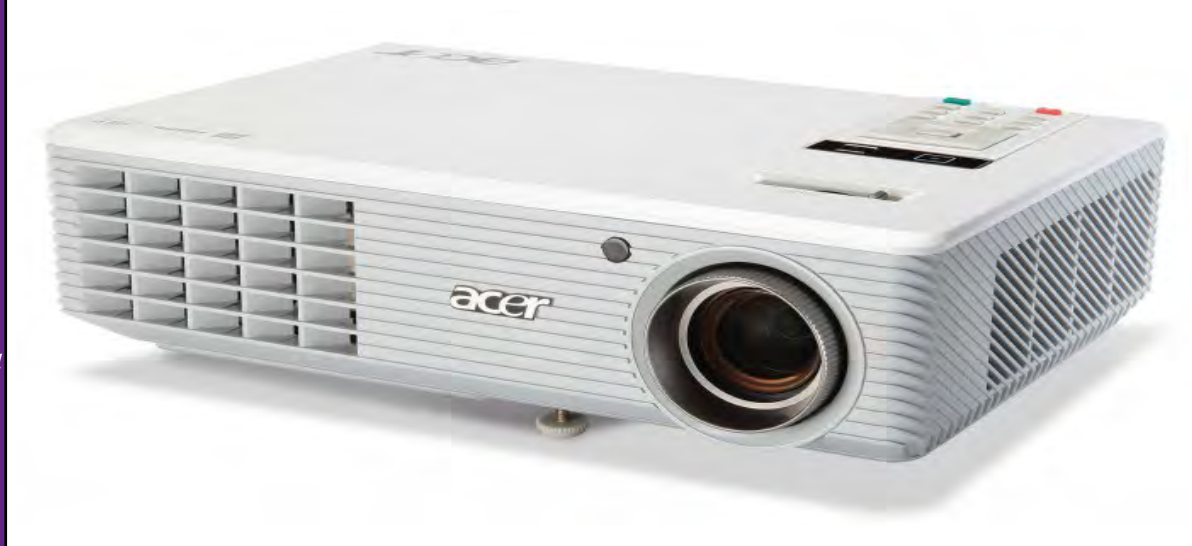
Acer h5360bd 3D DLP Projector

(GPU) with 352 Compute Unified Device Architecture (CUDA) Cores and a 2.5 GB Frame Buffer. The device can process up to an amazing 950 million triangles per second. The projector is an Acer H5360 1280 x 720, 2500 Lumen DLP system. In preliminary tests with one of the popular 3D video games, it felt that players could just step into the game and vanish into the digital nether world. The company is excited about updating and developing visual content for Duel•Ality 2.0 .