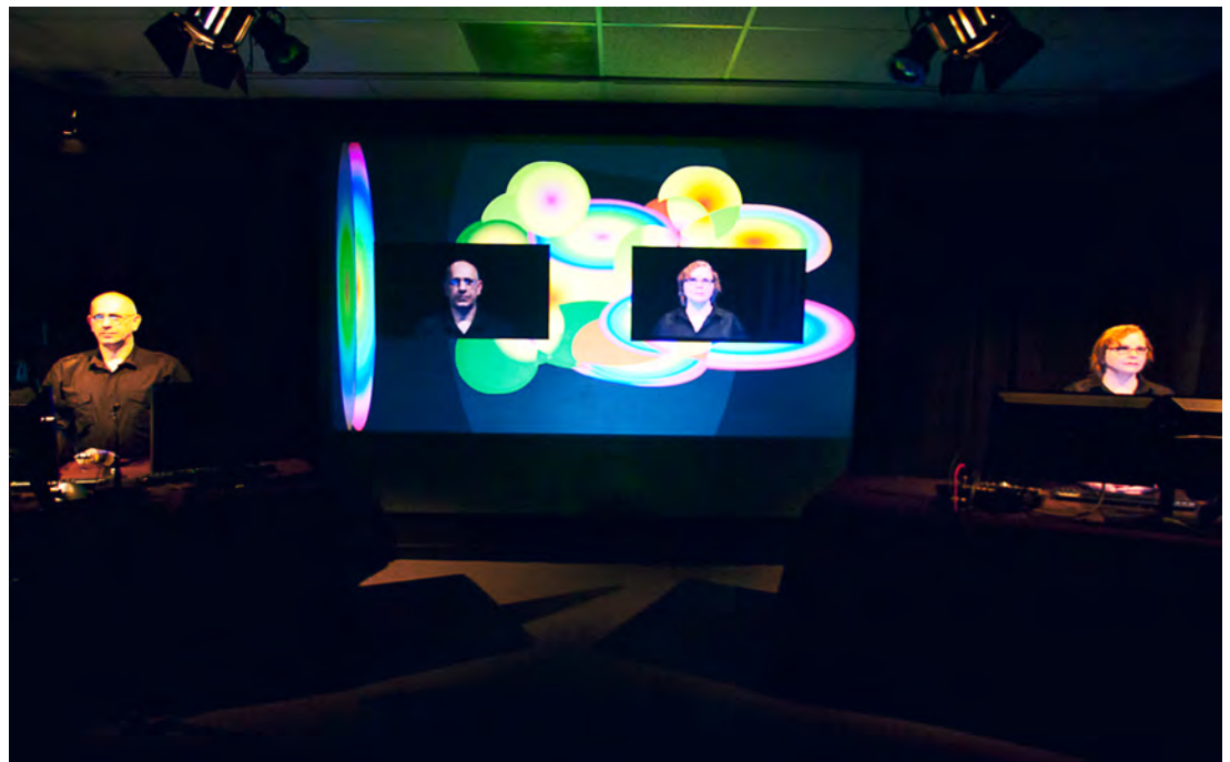
Jimmy and Elizabeth Miklavcic in Duel•Ality 2.0