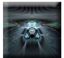
Compass On Licorace Lake (2020)