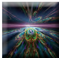
Pointing The Way (2020)