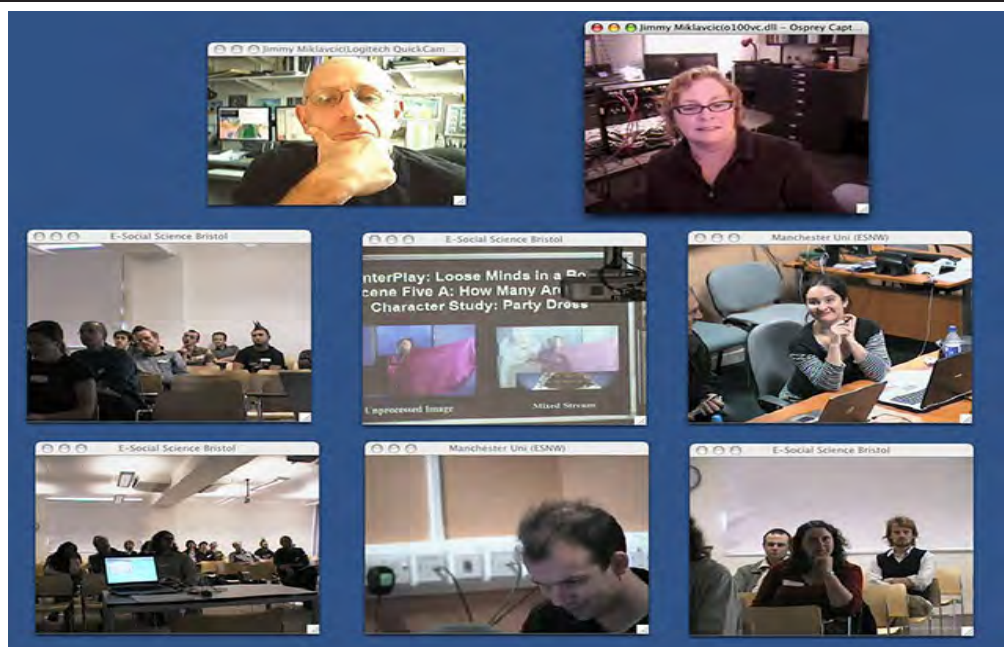
Access Grid® Symposium October 16, 2006