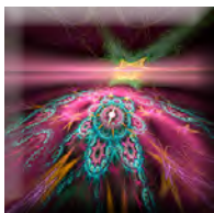
Compass On A Red Foothill (2020)

Another Language Performing Arts Company's Art-of-the-Month was created to publicly feature a variety of visual art expressions created by the directors of Another Language. Exhibiting abstract acrylic to digital paintings, and running the gambit in-between, this gallery exhibition offers the viewer an online gallery experience with a new addition each month. The Art-of-the-Month web program began September 2010, and features a variety of paintings, showing a body of work spanning decades. Extensive visual art galleries are available to supporting members in the Membership area of the website. Below are four of Elizabeth Miklavcic's works: