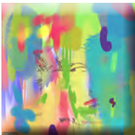
I Had This Thought (2018)