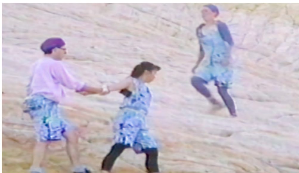
Slickrock September 26, 1992

For Information Call: (801) 707-9930 e-mail: info@anotherlanguage.org www.anotherlanguage.org