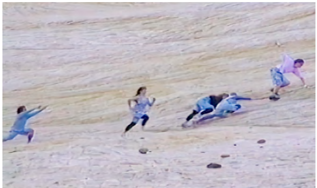
Slickrock September 26, 1992