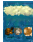
Clouds Over The Oquirrh